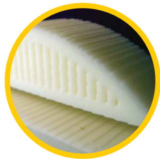
InVision printer model with supports

The InVision Finisher provides reliable, durable, versatile and convenient support removal for models produced with the InVision 3-D printer.